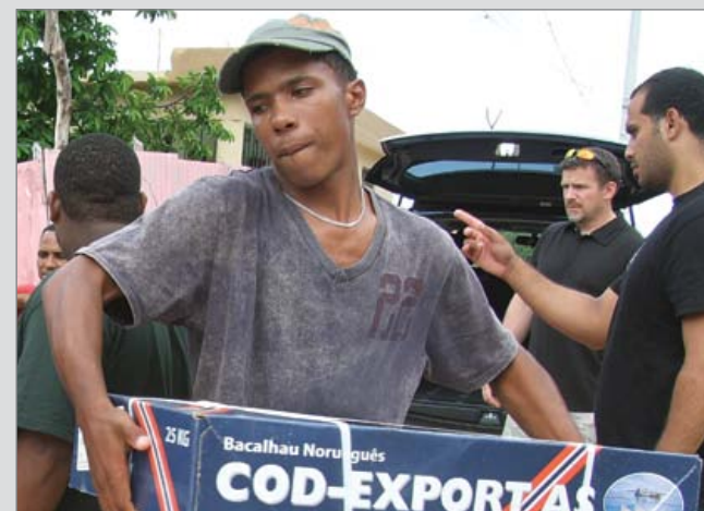
Believers in the Dominican Republic load supplies to transport to CC Port-au-Prince's tent city.