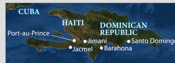
The Dominican Republic is east of Haiti on the Caribbean island the two nations share.

CC Delta, PA www.ccdeltapa.org calvary@ccdeltapa.org 717-456-7600